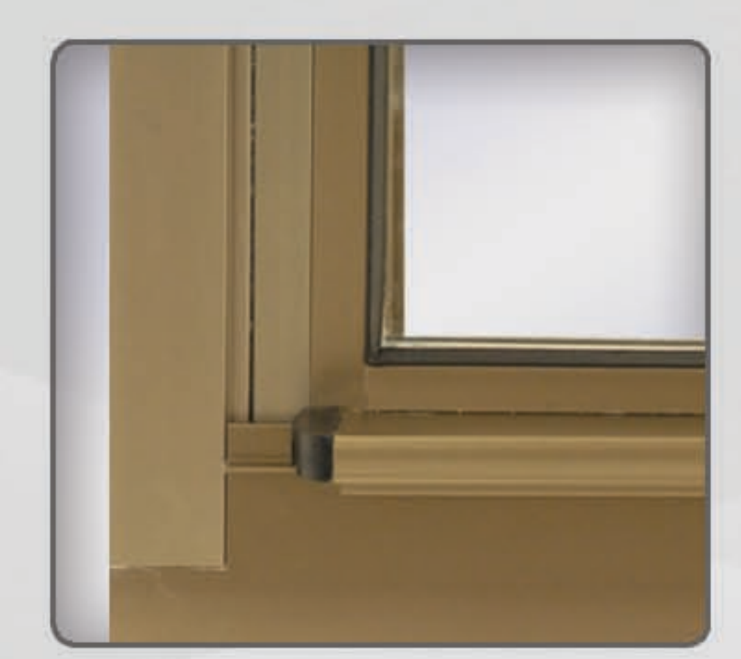
Continuous Lock Rail