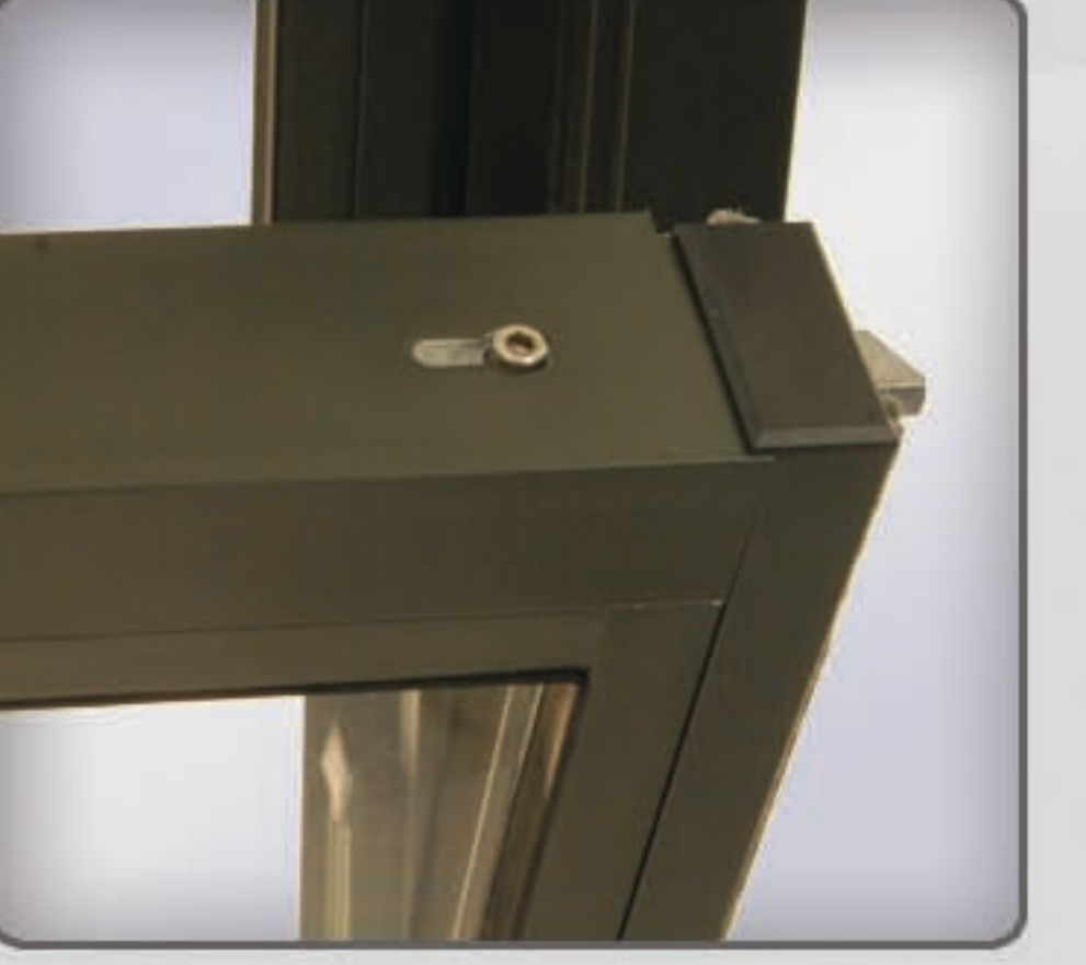
Concealed Tilt Latches