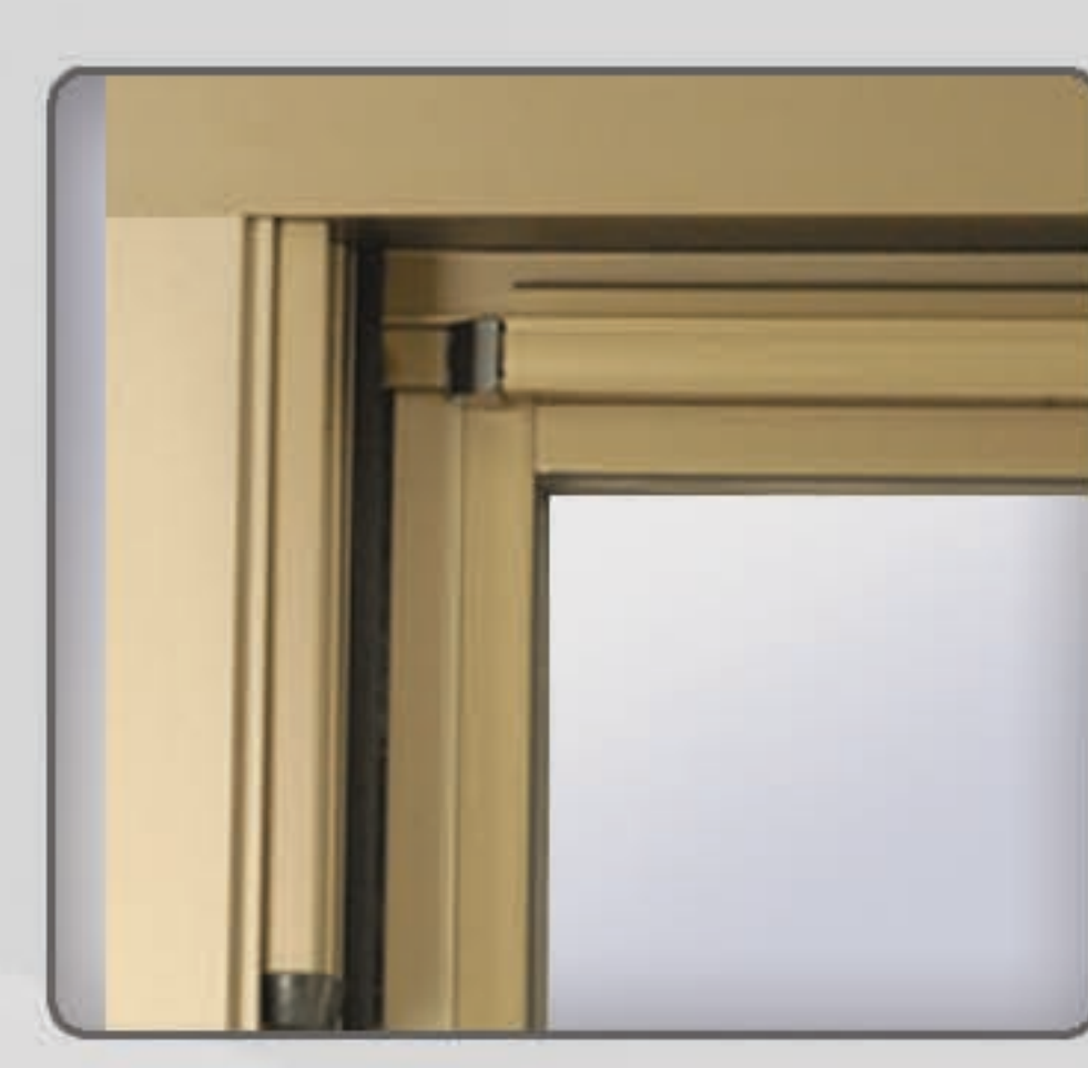
Metal Sash Stops